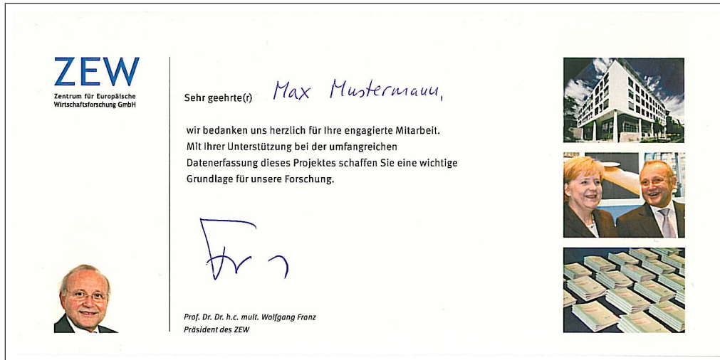
Figure 1: Thank-you Card

Note: The translation of the text on the card is: "Dear John Public, we would like to thank you cordially for your dedicated work. With your support for this project's comprehensive data-entry, you provide an important basis for our research."