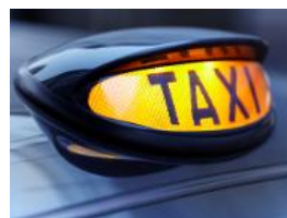
Taxi rental startups plan to share traffic data with govt