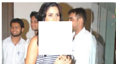
Katrina Kaif avoids media at the airport