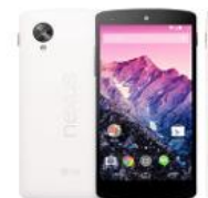
Google's Android Kit Kat OS: 10 features