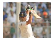
Difficult to imagine cricket without Sachin: Omar