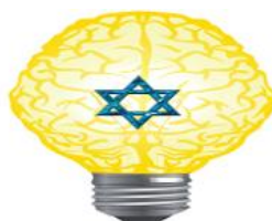
What makes Israel an innovation hub