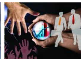
Startups collaborate with peers to find customers and earn revenue