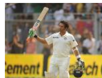
Sports Min wishes Sachin for completing a glorious career

Tendulkar, in an emotional speech said that the twenty-four years of cricketing journey have been very special for him. "My life between 22 yards for 24 yrs.