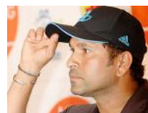
Sachin to get Bharat Ratna; first sportsperson to bag it