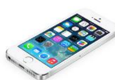
How to fix the 7 most common problems with iOS