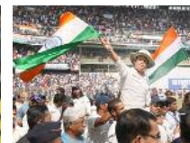
'The end of an era': Bollywood on Sachin's retirement