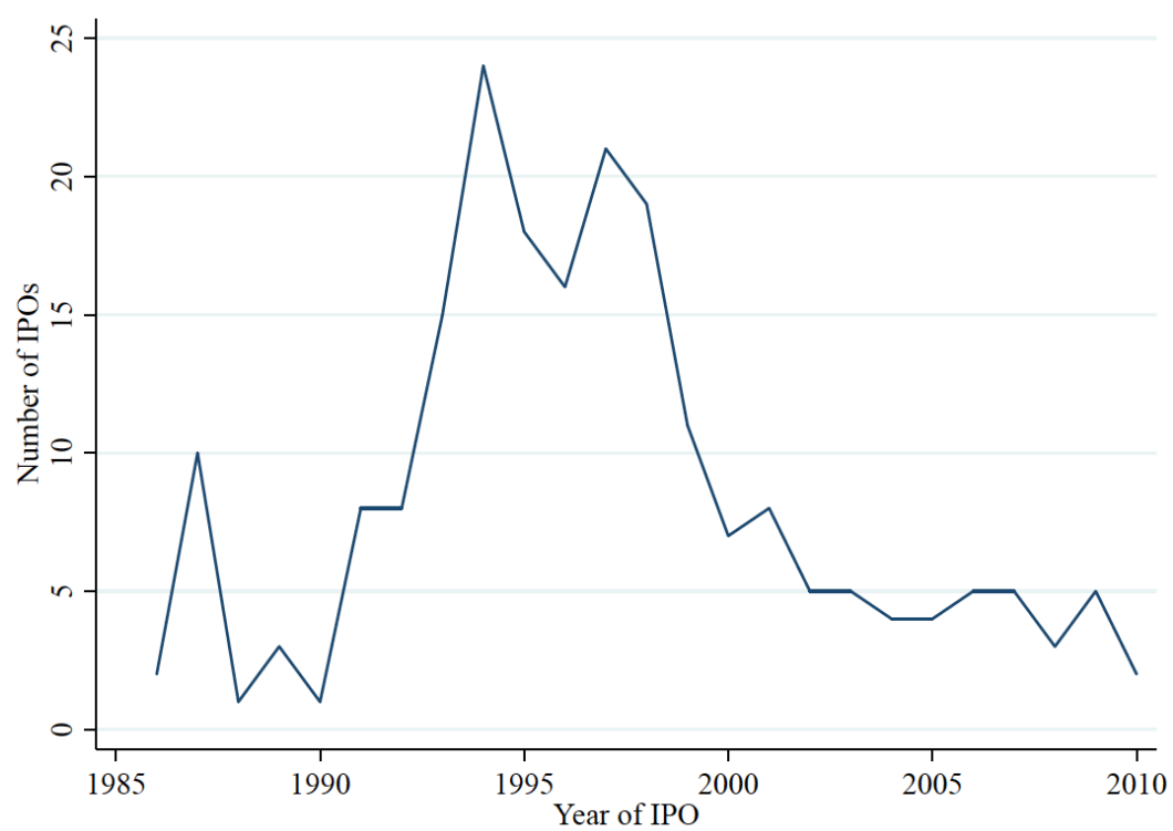
FIGURE 1. TIME SERIES OF SAMPLE IPO ACTIVITY