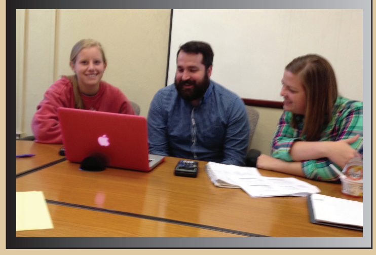
Around Price College -- (left) working together on a community service project; (above) students access the Action Learning Center, set up to enhance the learning experience for introductory finance and managerial accounting classes